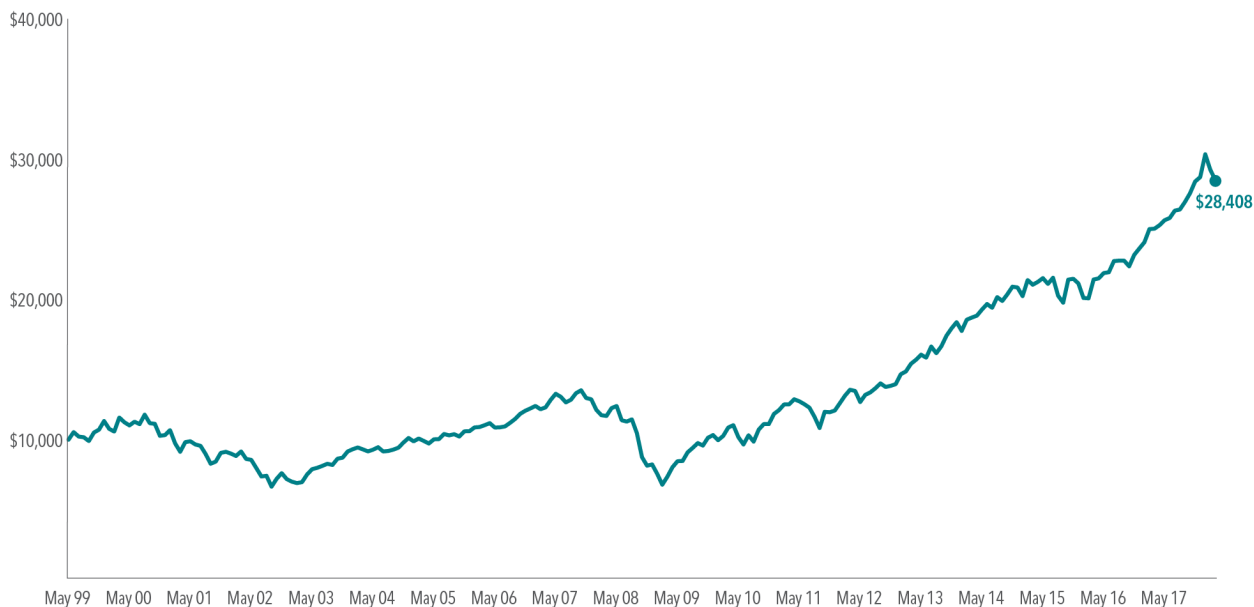
Exhibit 1. Hypothetical Growth of Wealth in the S&P 500 Index, May 1999–March 2018

© 2018 S&P Dow Jones Indices LLC, a division of S&P Global. All rights reserved. Not representative of an actual investment. Indices are not available for direct investment; therefore, their performance does not reflect the expenses associated with the management of an actual portfolio.